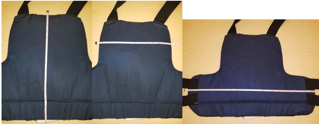
Figure 4, Measure Back Dimensions