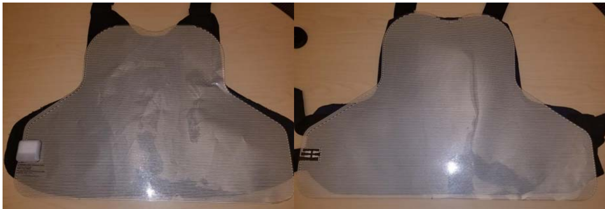
Figure 5, AID Sensor Size Example

Example: For the vest measurements pictured in this document, the front of the vest has measurements of 14" height, 12" chest width and 24" waist width. Those measurements align with the 009, LargeB (14x12x21) on the size chart. The back of the vest has measurements of 15.5" height, 12" chest width and 24" waist width. Those measurements align with the 010, LargeC (15.5x12x24) on the size chart. See those AID sensor sizes pictured below.