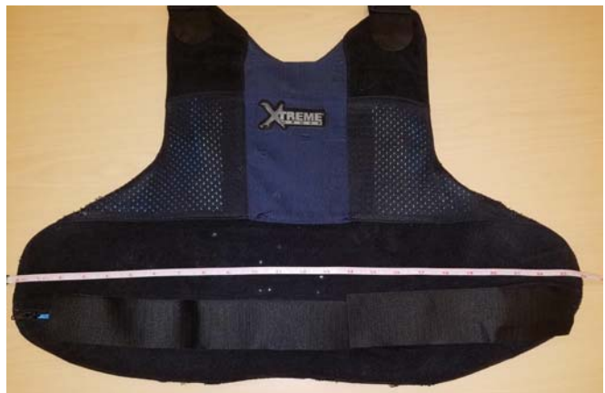
Figure 3, Measure Front Waist