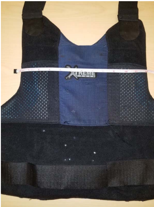
Figure 2, Measure Front Chest